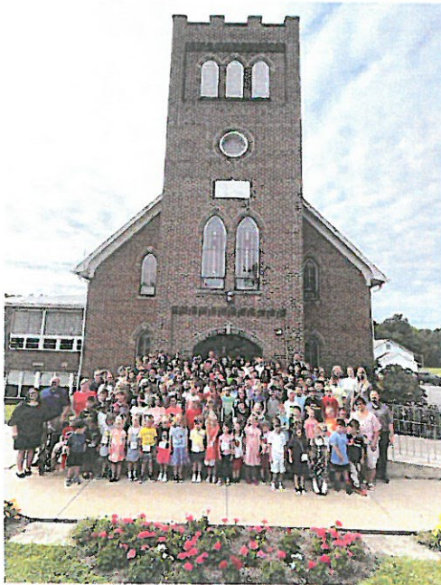
First Day of School 2023

We thank you for your prayers for our school and for your gift to the Annual Fund, whether by check or by online donation at: www.school.stlukecabot.org